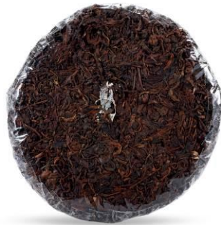
LOT 553 AN ANTIQUE PU'ER TEA CAKE, 'SONG PIN HAO', 1920S weight: approximately 219g process: non-fermented tea storage: dry