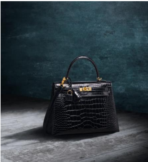
Lot 792 HERMÈS 2018 A SHINY BLACK ALLIGATOR SELLIER KELLY 25 WITH GOLD HARDWARE L.25 × H.18 × D.10CM. , CONDITION REPORT GRADE I Sold Price: HKD 542,800