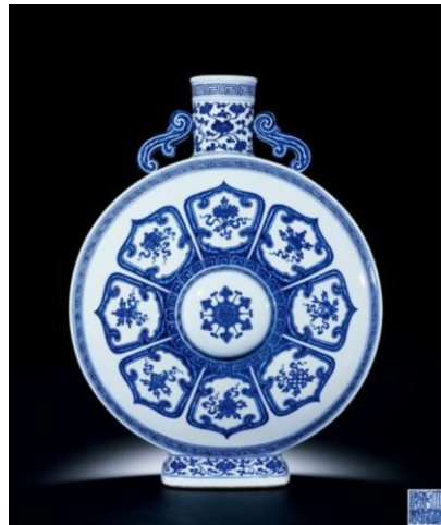
Lot1031 A FINE AND IMPORTANT BLUE AND WHITE 'BAJIXIANG' MOONFLASK, QIANLONG PERIOD, 1736-1795 H 50 cm Sold Price: HK$ 8,142,000