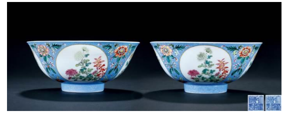
Lot 1038 A PAIR OF FINE FAMILLE-ROSE BLUE- GROUND MEDALLION 'DOUBLE NINTH FESTIVAL' BOWLS QIANLONG PERIOD, 1736-1795 D 15 cm Sold Price: HK$ 7,316,000