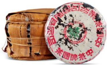
LOT 529 SEVEN PIECES OF VINTAGE PU'ER TEA CAKES, 1950S