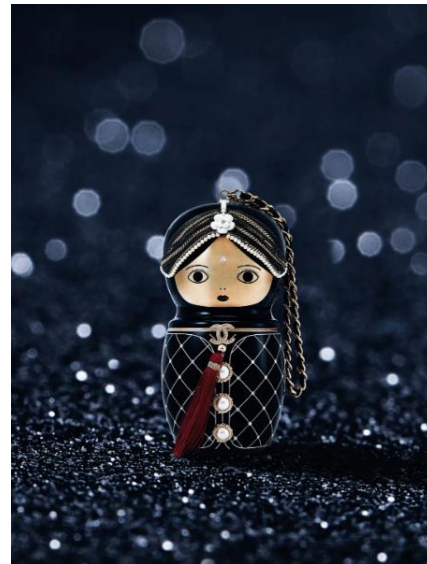
Lot 793 CHANEL 2012 A MÉTIERS D'ART PARIS-BOMBAY RUNWAY BLACK LUCITE MATRYOSHKA EVENING BAG WITH GOLD HARDWARE W.9 × H.19 × D.7 cm Condition Report Grade I-1.5 Sold Price: HK$ 377,600