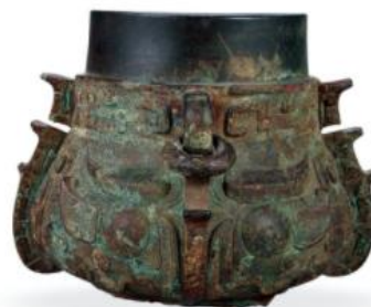
Lot 983 AN ARCHAIC BRONZE 'TAOTIE' WINE VESSEL, YOU, SHANG DYNASTY C. 1500 – 1050 B.C. H 21.7 cm Sold Price: HK$ 2,124,000