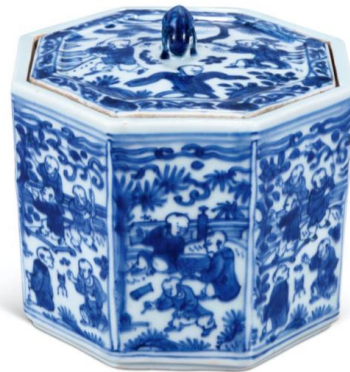
Lot1012 A BLUE AND WHITE 'PLAYING CHILDREN' OCTAGONAL BOX AND COVER, WANLI PERIOD, 1573-1620 H 13.5 cm Sold Price: HK$ 4,720,000