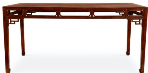
Lot 926 A LARGE HUANGHUALI PAINTING TABLE, HUAZHUO, 18TH CENTURY L 212 cm W 76.2 cm H 88.9 cm Sold Price: HK$ 2,832,000