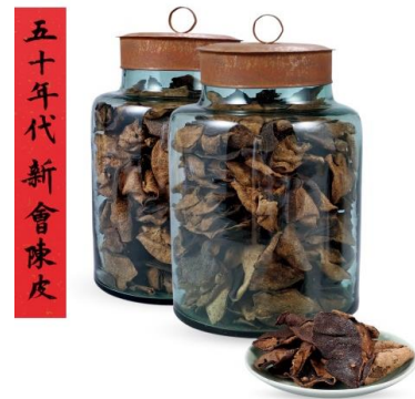
LOT 590 DRIED TANGERINE PEEL, 1950S weight: 1,800g condition: completely clear