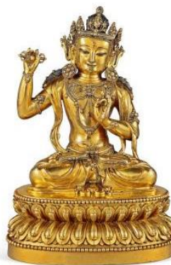
Lot 920 A GILT-BRONZE FIGURE OF VAJRAPĀṆI YONGLE PERIOD, 1403-1424 H 21cm Sold Price: HK$ 5,664,000