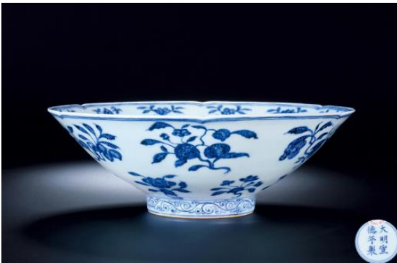
Lot1008 A RARE BLUE AND WHITE 'FLORAL AND FRUIT' HEXAFOIL BOWL XUANDE PERIOD, 1426-1435 D 22.6 cm Sold Price: HK$10,384,000