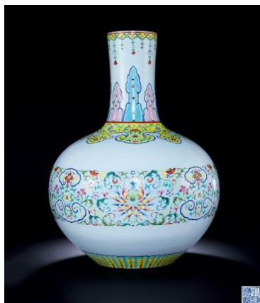
Lot 911 A RARE FAMILLE ROSE 'LOTUS SCROLL' BOTTLE VASE, TIANQIUPING QIANLONG PERIOD, 1736-1795 H 50.8 cm Sold Price: HK$ 17,110,000