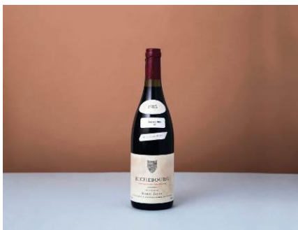
Lot 1075 Domaine Henri Jayer Richebourg 1985 Magnum Cote de Nuits, Burgundy, France 1.5L 1 bottle Capsule broken