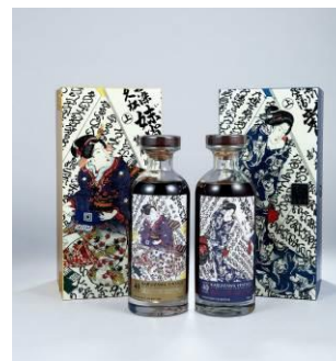
Lot 1413 Karuizawa 40 - Geisha #3260 Karuizawa 40 - Geisha #4560 Single Malt Sherry Butt 1 of 392 bts Single Malt Sherry Butt 1 of 192 bts

10 times over its pre-auction low estimate