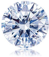
Lot 2023 A 10.01 Carat D Color, Flawless, Type IIa Unmounted Diamond

Sold price: HKD 23,600,000 Highest-priced item sold in the sale