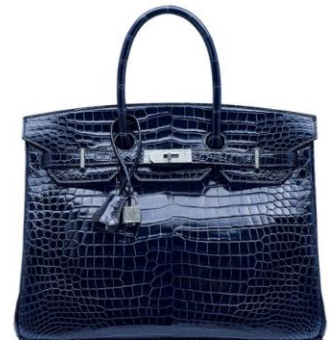
Lot 2169 HERMÈS 2012 An Extraordinary Shiny Blue Marine Porosus Crocodile Birkin 35 with 18k White Gold and Diamond Hardware