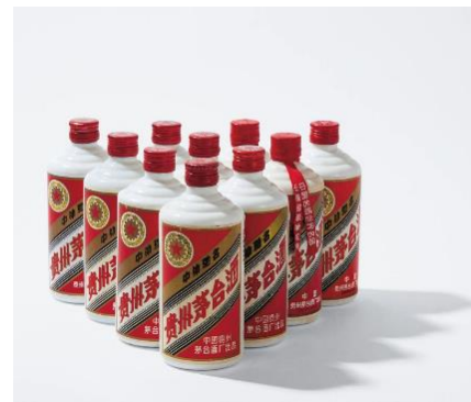
Lot 1732 A Set of "Moutai with Iron Covering" 1987-1996 ABV:53% Vol:500ml Quantity:10 bottles (One bottle per year)