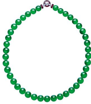
Lot 2031 An Impressive Jadeite Bead, Ruby and Diamond Necklace

Sold price: HKD 23,600,000 Highest-priced item sold in the sale