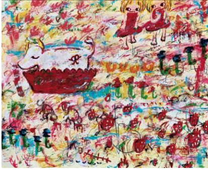
Lot 160 Ayako Rokkaku A Cow in the Bath Painted in 2008 acrylic on canvas 130.5 × 162.2 cm.

Sold price: HKD 1,770,000 *triple its pre-auction low estimate