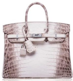
Lot 2161 HERMÈS 2019 A Rare Matte White Himalayan Niloticus Crocodile Birkin 25 with Palladium Hardware

L.25 × H.18 × D.10 cm Condition Report Grade I