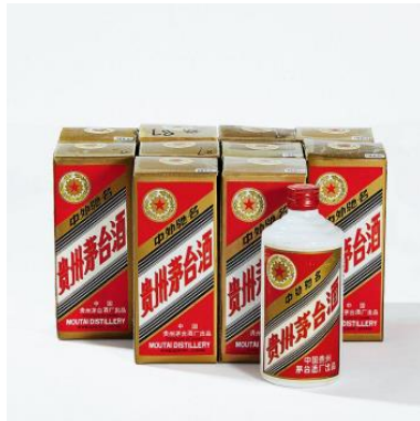
Lot 1747 Kweichow Moutai 1987 (with Iron Covering) ABV:53% Vol:500ml Quantity:10 瓶