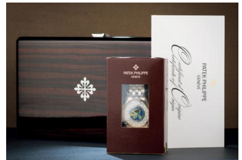
Lot 2080 Patek Philippe A Very Fine White Gold World Time Automatic Bracelet Watch with Cloisonné Enamel Dial, In Single Seal Condition Complications World Time, Ref. 5131G-010, CIRCA 2013