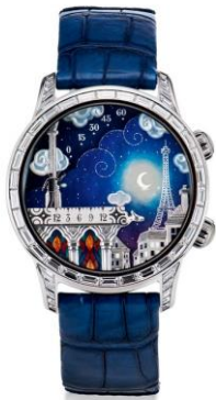
Lot 2089 Van Cleef & Arpels A Very Fine and Elegant, White Gold and Baguette Diamond set, Five-Minute Repeating Mechanical Wristwatch, with Miniature Painted Translucent Enamel Dial