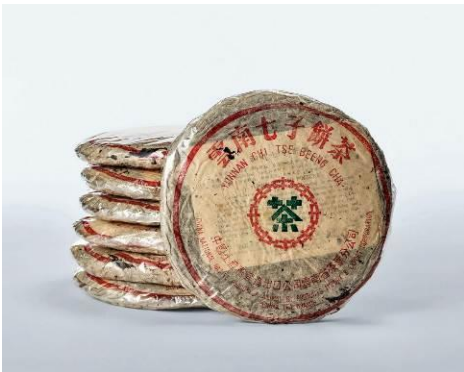
Lot 1627 Seven Pieces of Pu'er Tea Cakes, 1980s Weight: Approximately 2160g