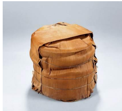
Lot 1609 Seven Pieces of Pu'er Tea Cakes, 1980s-1990s Weight: Approximately 2343g