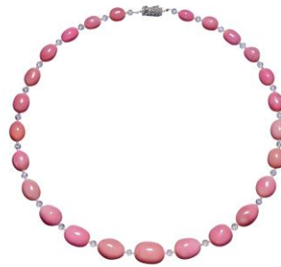
Lot 2044 An Important Conch Pearl and Diamond Necklace