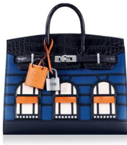
Lot 2195 HERMÈS 2019 A Limited Edition Matte Blue Marine Alligator & Orange Swift, Madame, Sombrero & Epsom Leather Sellier Faubourg Birkin 20 with Palladium Hardware

L.20 × H.15.5 × D.11 cm Condition Report Grade I