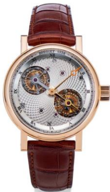
Lot 2117 Breguet Very Fine Rose Gold Double Tourbillon Mechanical Wristwatch Classique Complications, Ref. 5347BR/11/9ZU, CIRCA 2019