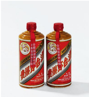
Lot 1756 Kweichow Moutai 1983-1984 ABV:53% Vol:540ml Quantity:2 瓶