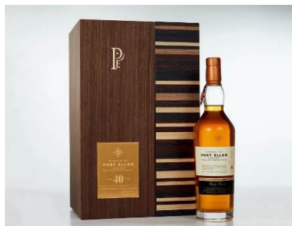
Lot 1286 Port Ellen 40 Single Malt Sherry Butt Distilled 1978 Bottled 2018 ABV 56.2% 700ml 1 of 328 bts