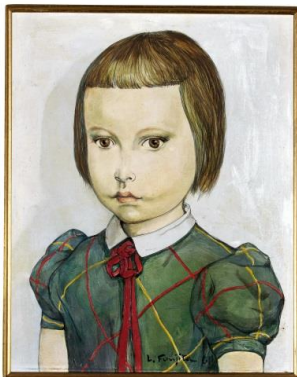
Lot 135 Léonard Tsuguharu Foujita Girl with a Red Bowknot Painted in 1961 oil on canvas 24 x 19 cm.

Sold price: HKD 3,835,000 *nearly four times its pre-auction low estimate *artist's record high in the past five years in auction market